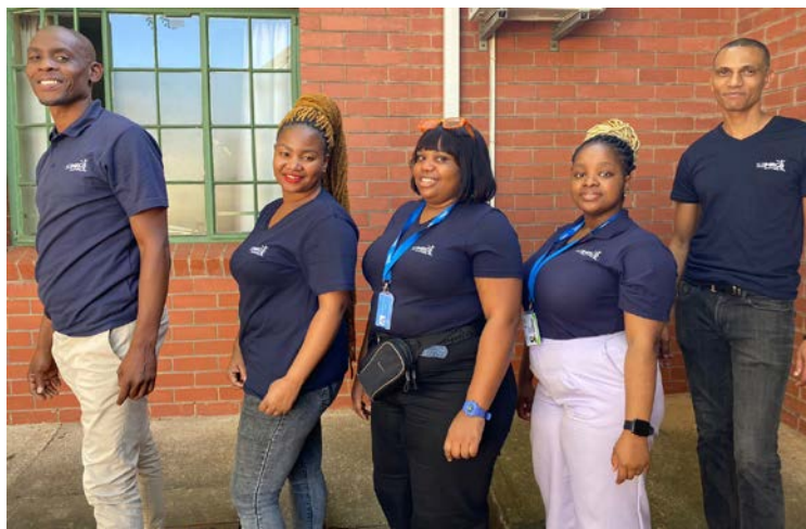
HSRU Durban staff in their SAMRC T-shirts