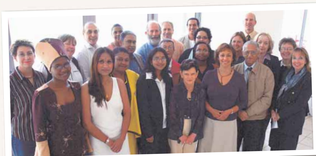
Advisory Panel Meeting 2005