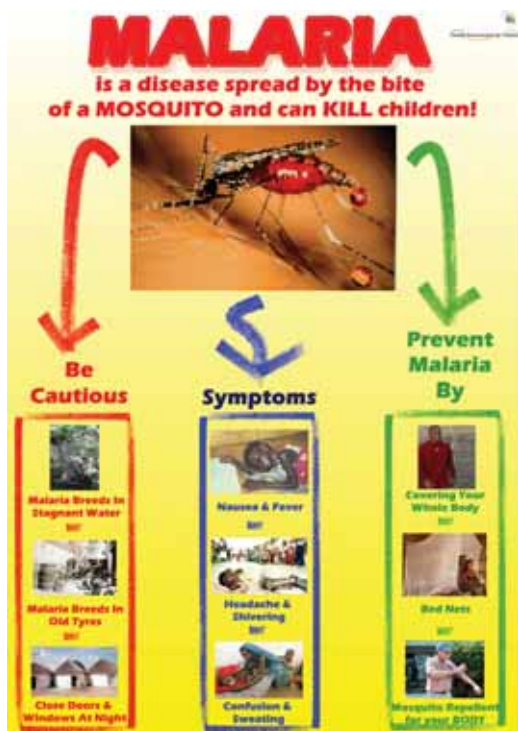
A Sample Poster drafted by a UJ student group