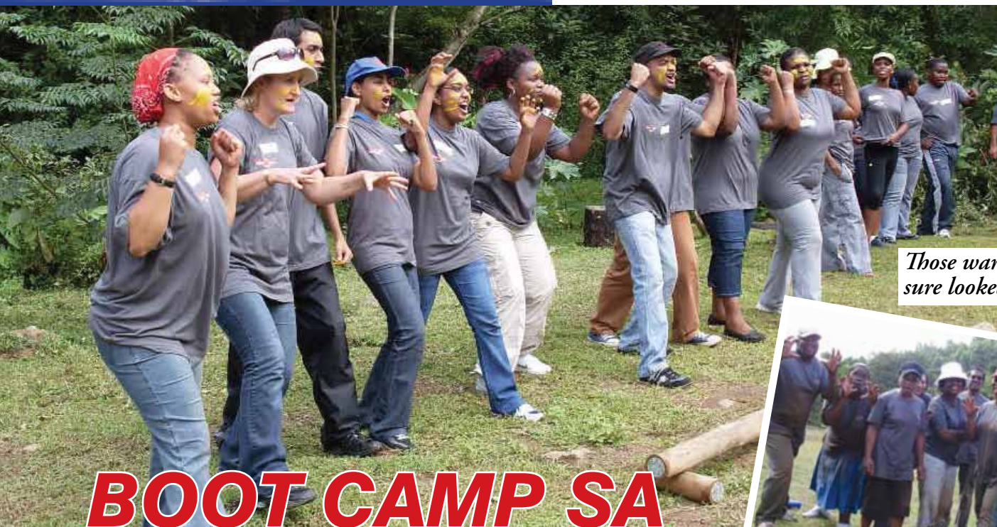
Those war cries sure looked scary!