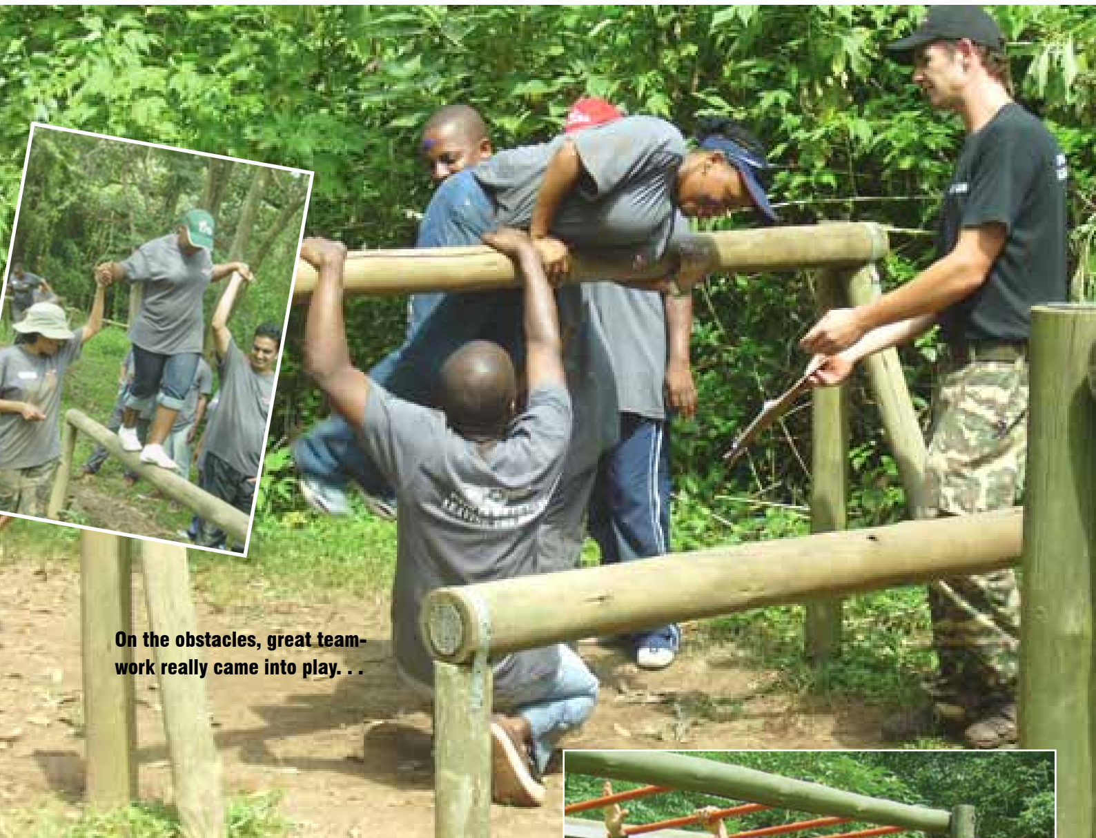
On the obstacles, great teamwork really came into play. . .

Six teams each made up the larger groups A, B and C, which soon got down to business. Although teams completed tasks in different orders, all completed the following: Mud Crawl ; Commando Obstacles ; Radio Towers ; Landmine Disarming ; Path Clearance ; Team Building workshop .